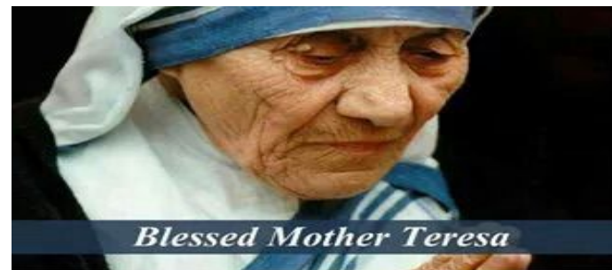
Blessed Mother Teresa

In today's gospel, Jesus confronted the Pharisees because of their hypocrisy. They never observed the law that they multiplied for their people. This is a dangerous way of life that we (the modern-day Pharisees), must be careful of. We must not live a hypocritical life, or even make life difficult for others. By saying that: "What comes out of a man is what defiles him," Christ calls us to self-evaluation. The malicious intentions, the hatred, pride, and corrupt tendencies we harbor in our hearts are what define and make us who we are. They are the vices that make us bad. The quality of our life is measured by the quality of our heart and mind. If our mind and heart are infested and sick, our body would be sick a thousand times more, even without one knowing it. So, the most important thing that God needs from us is a pure heart.