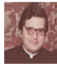
March 4, 1973